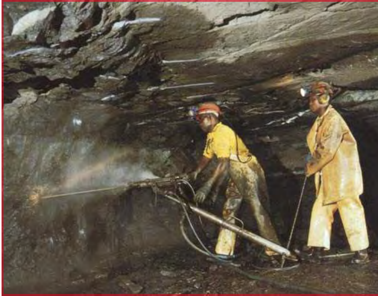
Samancor Chrome Mines. Drilling underground in one of the chromite seams.

Conventional tanning agents often pose considerable potential risks to man and the environment.